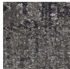
Truffle 35760 LRV 12.3