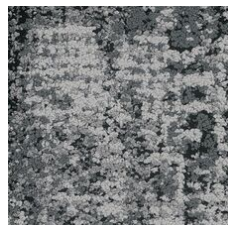
Fog 35518 LRV 15.6