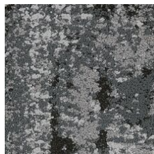
Rainstorm 35535 LRV 15.9